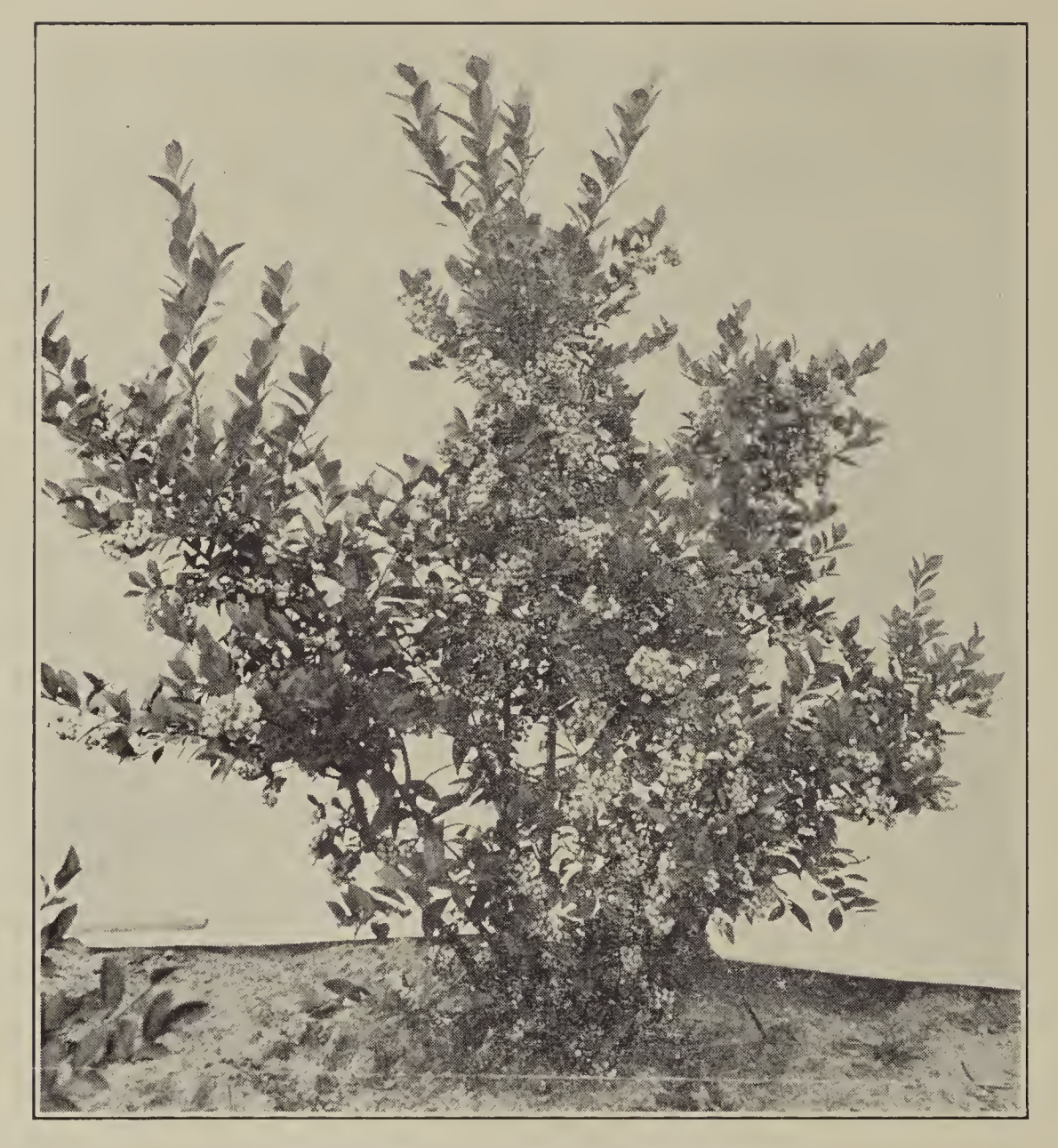
A Six-Year-Old Rubel Bush Carrying About Six Quarts of Blueberries